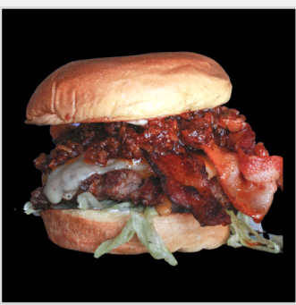
THE RON SWANSON

A portion of the proceeds from our community menu will be donated to Cleats 4 Kids