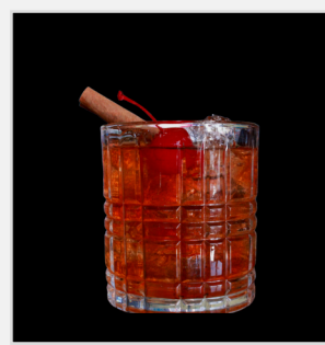
SPICED OLD FASHIONED

Soft serve ice cream shake with white chocolate, peppermint, strawberry drizzled along the side, topped with whipped cream, a chocolate wafer, & peppermint stick. 6.99