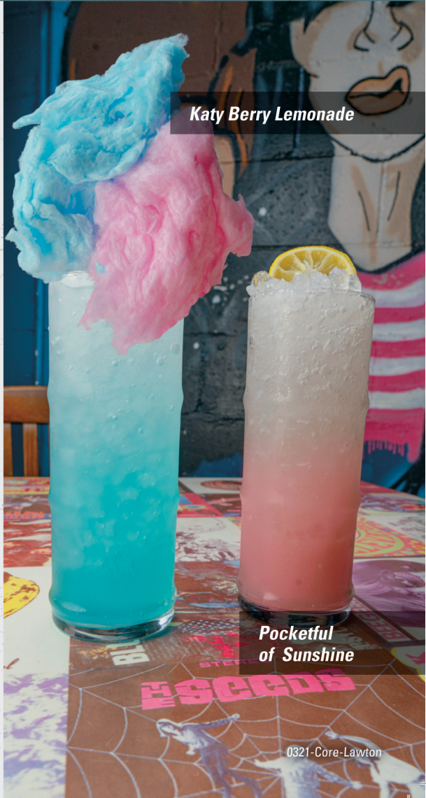
Katy Berry Lemonade

Made with Camarena Silver tequila & house mix, choose your flavor: Classic | Spicy Mango | Wild Berry | Cotton Candy | Strawberry 6