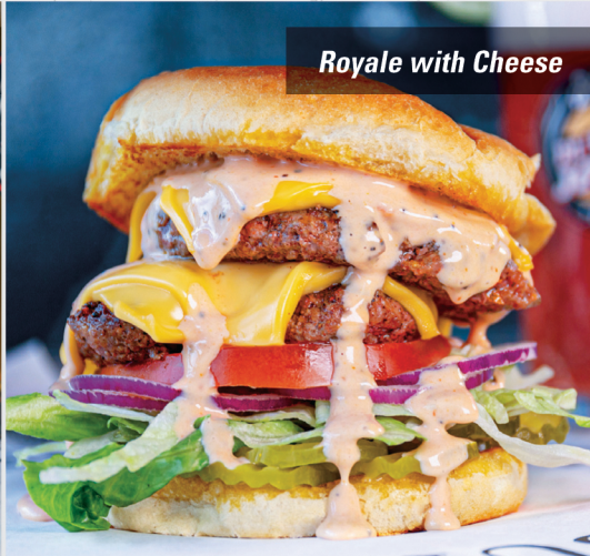
Royale with Cheese